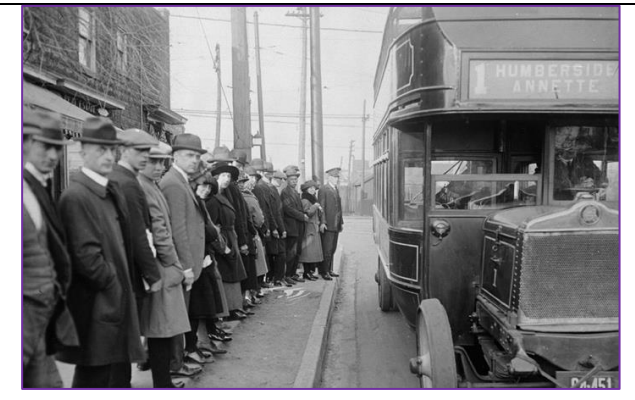
Waiting for the #1 bus, Humberside & Dundas St., 1923

Between 1921 and 1931, when St. John's celebrated its 50<sup>th</sup>, Toronto's population had grown from 522,000 to 627,000, with much of that growth based in west Toronto