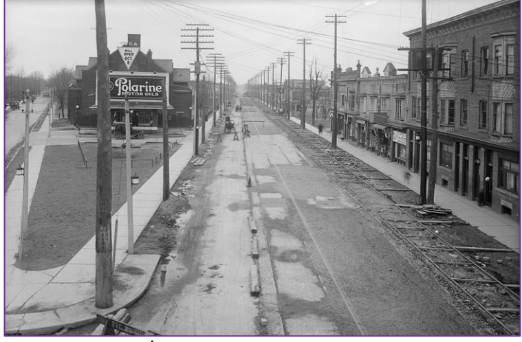
St. John's 2<sup>nd</sup> church behind sign, Dundas & St. John's Rd., 1923

The history of St. John's, like the Junction area, has been shaped by its development as a transportation hub, first as a confluence of trails for the Indigenous community